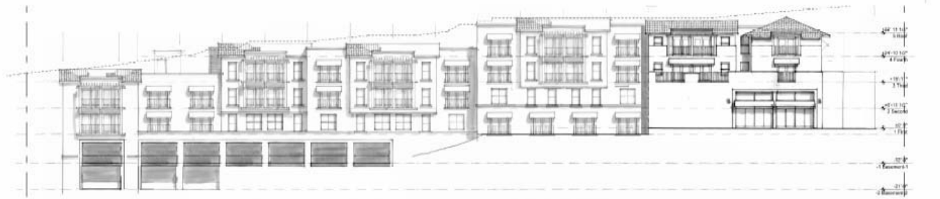
③ SIDE ELEVATION - EAST