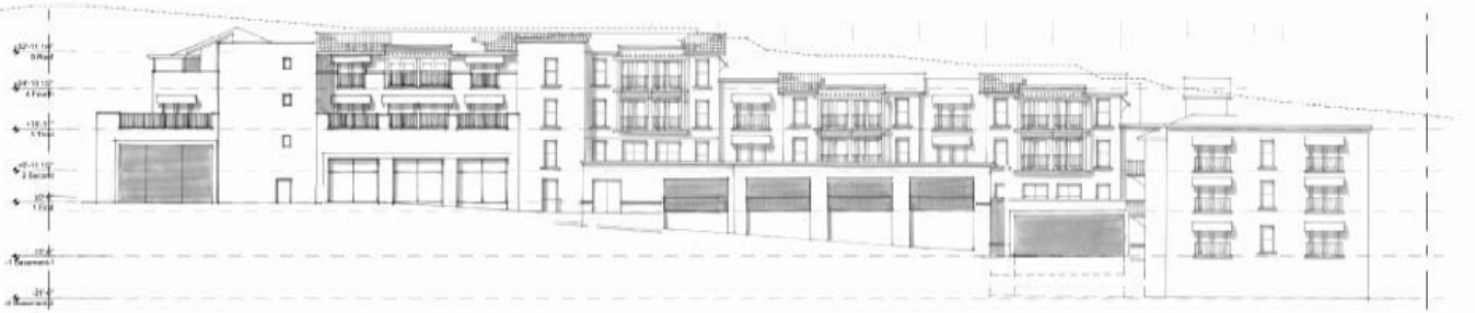
② SIDE ELEVATION - WEST